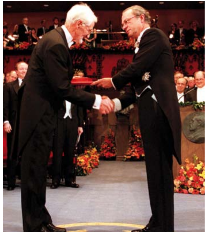
Professor Jens Christian Skou, Aarhus University, is awarded the 1997 Nobel Prize in chemistry for his discovery of the 'sodium-potassium pump'

• More research projects with international partners. Aarhus University wishes to develop international contacts and research networks in order to strengthen the university's position among